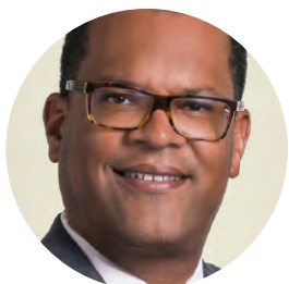
Fred Blackwell Chair